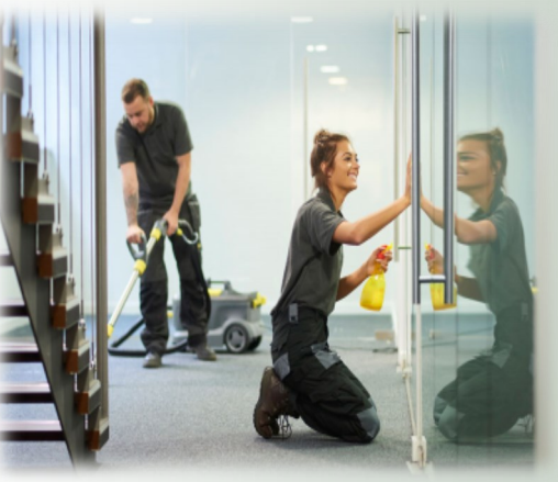
Article by: BES Commercial Cleaning

The cold months can unfortunately drag a lot of unwanted things into the office. That's why we've put together some winter cleaning tips to help keep the workplace / office clean. Keeping your office clean and sanitized helps with employee productivity and health.